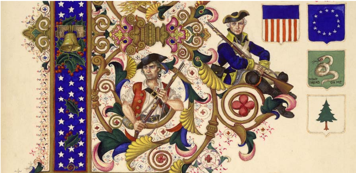
Bill of rights / Arthur Szyk, New Canaan.